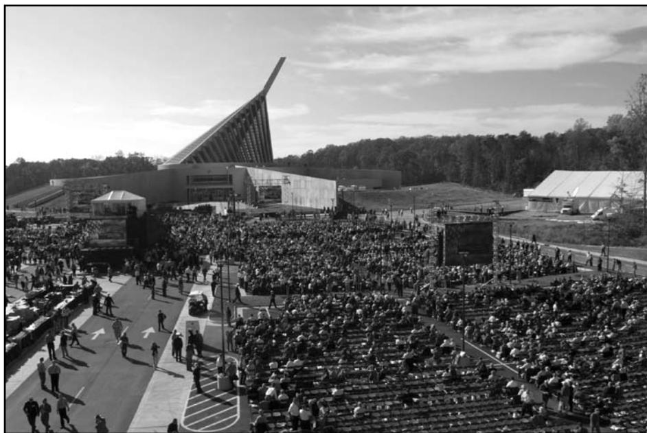
A crowd of thousands gathers for the National Museum dedication.