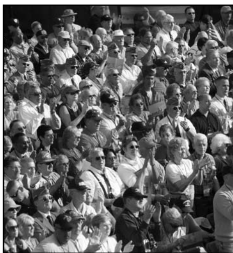
Project supporters gather for the ceremonies.

Speaking on a flawless fall afternoon, President Bush noted "These walls pay tribute to your contributions to American freedom. These walls remind all who visit here that honor, courage, and commitment are not just words. They are core values for a way of life that puts service above self."