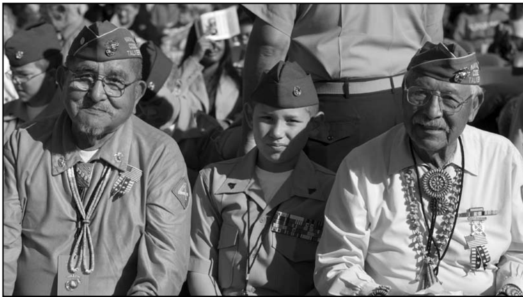
Young and old alike joined together to celebrate the opening of the National Museum.

Since its opening, the National Museum has received considerable public acclaim. The widespread media coverage of dedication included virtually unanimous approbation from the nation's cultural critics of the museum's evocative architecture and innovative interactive exhibitry. More than 300,000 individuals have visited the museum since dedication.