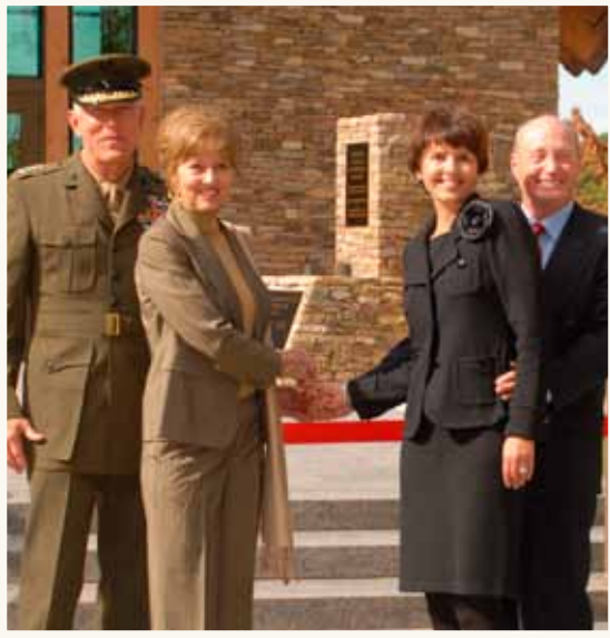
Semper Fidelis Memorial Chapel Dedication

As the campaign to complete the National Museum of the Marine Corps and Marine Corps Heritage Center continues, the complex presents to the American public an ever-growing array of compelling visitor attractions and powerful educational resources.