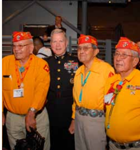
The 65th Anniversary of the Battle for Iwo Jima weekend