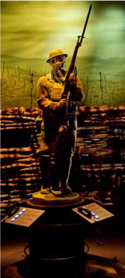
“Marines in World War I, 1917-1918” Gallery BELOW Semper Fidelis Memorial Chapel