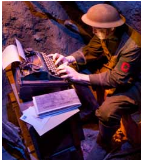
Chicago Tribune correspondent Floyd Gibbons, Marines in World War I, 1917-1918 Gallery