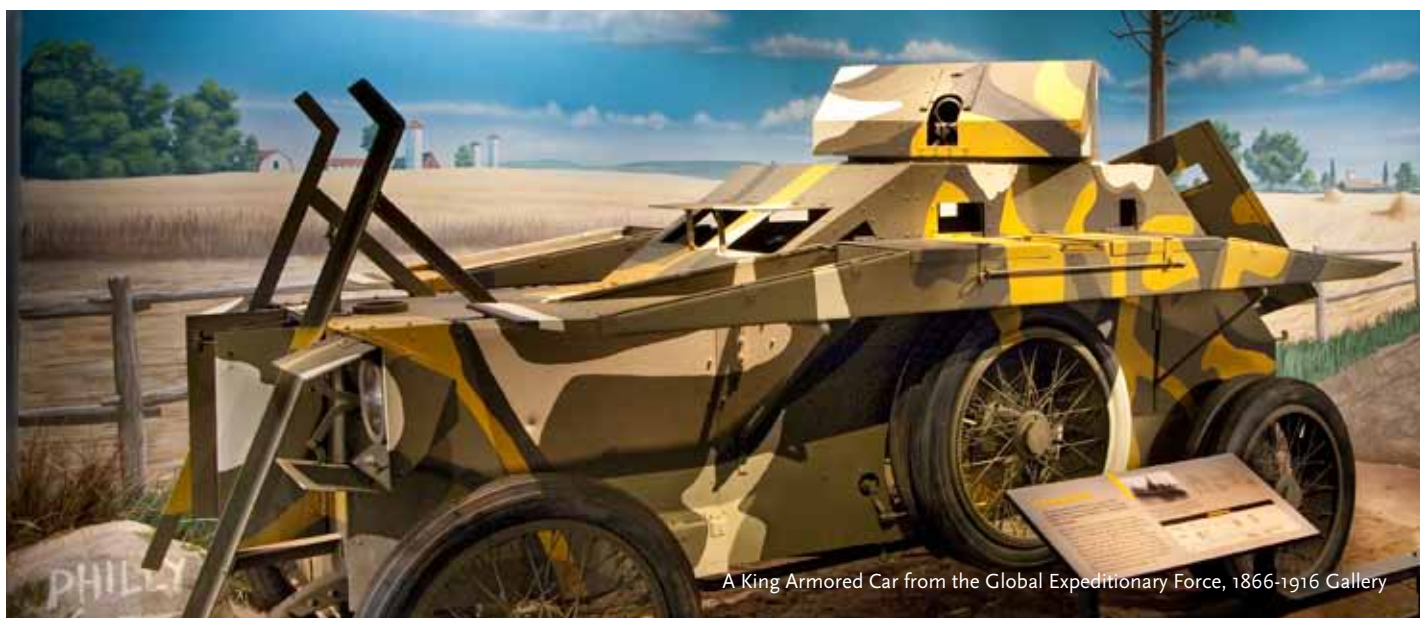
A King Armored Car from the Global Expeditionary Force, 1866-1916 Gallery