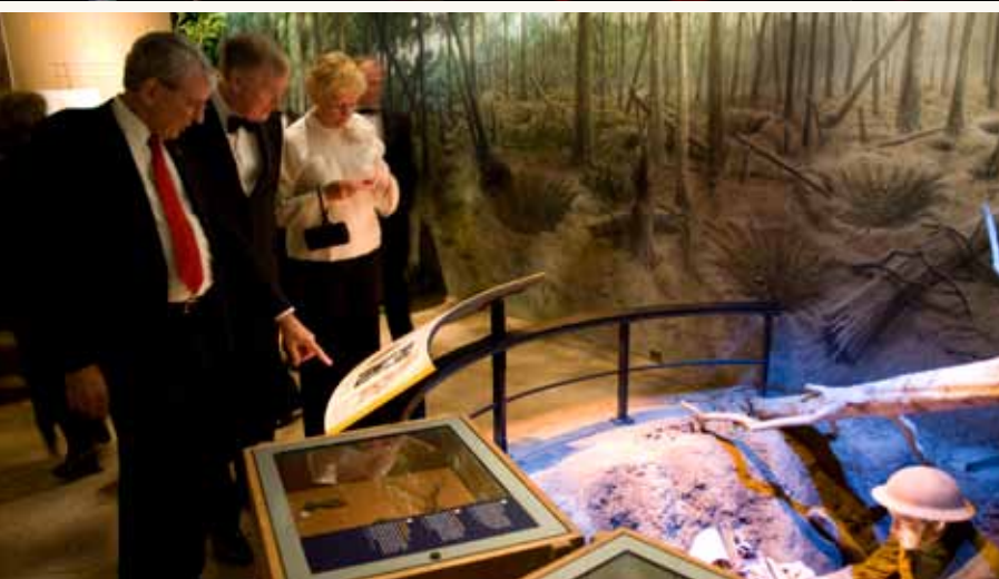
The "Early Years" Exhibit Opening Gala