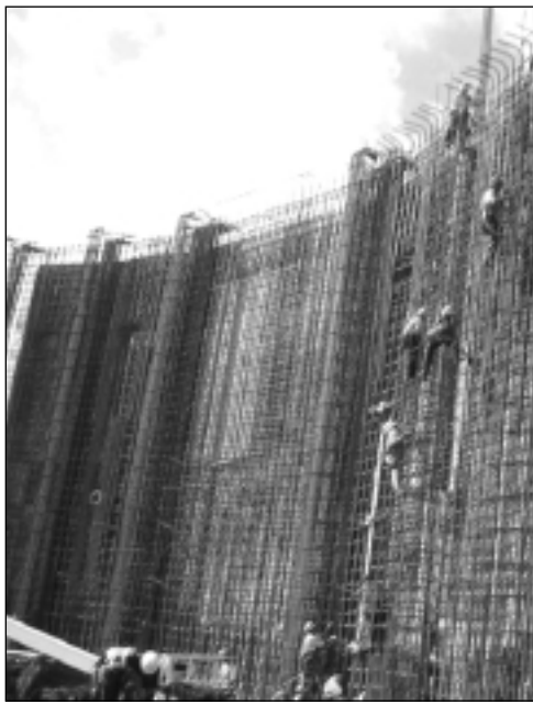
Workers build reinforced steel walls of the Central Gallery before concrete is poured.

Once the mast is raised, the grandeur of project architect Curtis Fentress' design concept will finally become much more tangible. Tens of thousands of drivers on nearby Interstate 95 will see a highly visible, new regional landmark take shape. All of this bodes well for public awareness of the project and consequent positive impact on our fund raising. We will continue to update you on construction in future issues of Legacy . ★