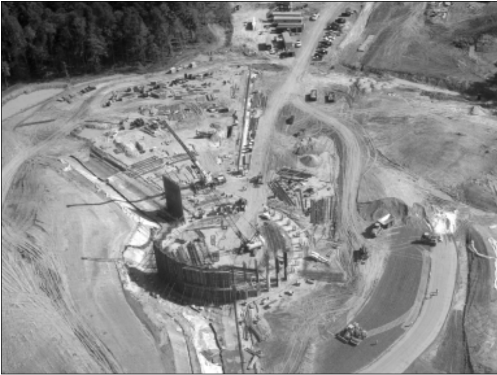
A recent aerial photograph shows construction underway aboard the Heritage Center site with the circular outline of the National Museum structure becoming apparent.