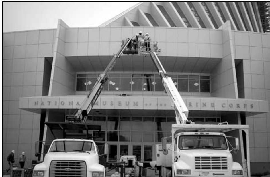
Workers install the Eagle, Globe & Anchor emblem atop the National Museum entrance.